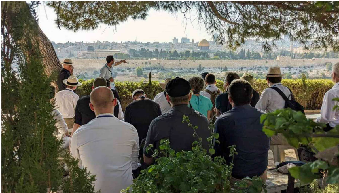
The Holy Land looking over Jerusalem

The College Vault at Campo Verano Cemetery was completely restored this summer. It was in a terrible state, unworthy of the memory of the six men buried there. The marble has been restored, the lettering touched up, the whole site cleaned, and a new plaque with the names of those interred there has been added. The Roman Association has very kindly funded this.