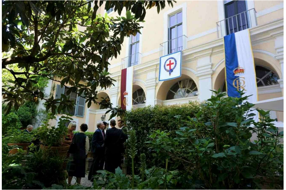
The Coronation Gala - with banners!

There have been a number of significant works done in the building, including: new windows on the main staircase; the restoration of the tiled floor in the main corridor; the restoration of the 18 th century main entrance door, kindly funded by the Friends. The swimming pool at Palazzola has been re-tiled through a gift from the Roman Association.