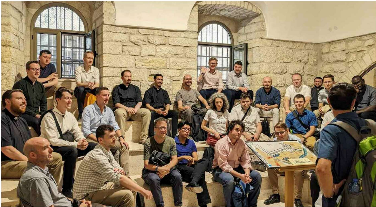
The Holy Land at Ecce Homo