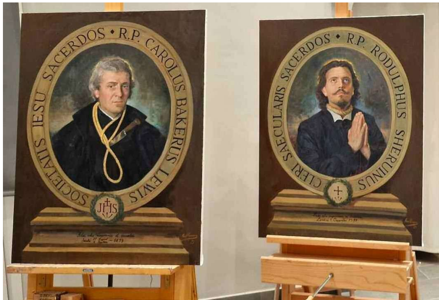
The two new Martyrs' Portraits that now hang the Refectory